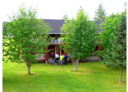
Accommodation in Tyrnävä on FinLine 2022.

The participation fee is 180 € including the services of the bus, basic snacks, transportation of your luggage during skating and bus transportation from Helsinki to Saarijärvi and back from Kokkola to Helsinki. Because FinLine is formally organized only for members of our club, you also have to pay the annual membership fee of 30 € of Street Gliders (total 210 € unless already a member for 2024).